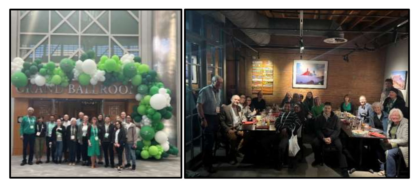
Many Canadians attended the CCF conference in Salt Lake City to share their experiences and learn of new breakthroughs

At least 20 Canadian patients, caregivers and advocates attended the CCF annual conference in Salt Lake City in April, which is a huge jump from attendance in previous years. CHCC was able to connect with numerous Canadian patients and caregivers, and we learned of several upcoming treatments in the United States that we will continue to follow with interest. It was also a chance for Canadians from B.C., Alberta, Manitoba, Ontario and Quebec to meet and share their experiences.